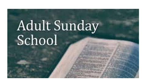
NO SUNDAY SCHOOL During the Summer

Please join us on Sunday, July 21st following our worship service, for a church picnic held in Fellowship Hall. This is the best of both worlds as picnic food will be coupled with a bug-free, dry, cool environment! Hotdogs, beverages, and chips will be provided ~ as well as all plates and utensils. Please bring a dish to share as you are able.