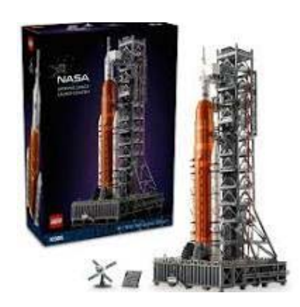
Loose Bricks By Joe Baur