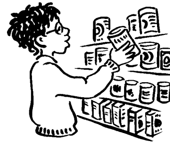
giving to people in need

Welcome to worship. Today is the second Sunday in Lent. During Lent, people get ready for Easter by: